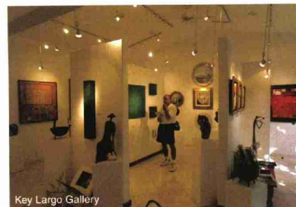
Key Largo Gallery

New on the scene in the Middle Keys is the Holiday Inn Express & Suites, with 134 rooms and a 24-hour business center; and a new conference and event facility at the Coral Lagoon Resort that accommodates up to 75.